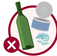
Glass, Metal, & Any Sharps