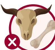
Animal Carcasses & Large Bones