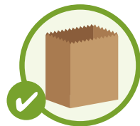
100% Paper Bin Liners & Bags