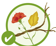
Cut Flowers, Twigs, Leaves & Grass Clippings