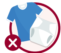
Diapers, Sanitary Products or Clothes