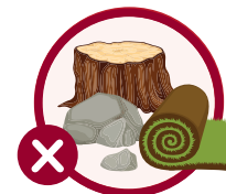
Tree Stumps, Dirt, Rocks, Sod & Weeds