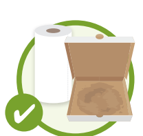
Food Soiled Paper & Cardboard