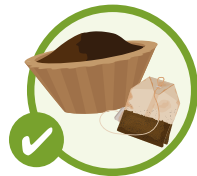
Coffee Grounds, Paper Filters & Tea Bags