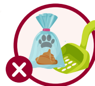
Cat Litter & Dog Feces