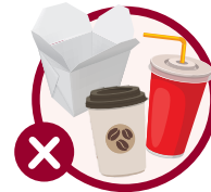
Waxy or Plastic Lined Cardboard & Paper Containers