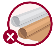
Tin Foil, Parchment Paper & Butcher Paper