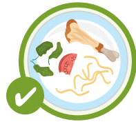
Spoiled Foods & Table Scraps