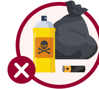
Household & Hazardous Waste