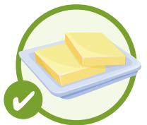
Solidified Fats & Oils (small amounts)