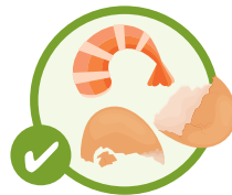
Eggs, Egg Shells & Shellfish