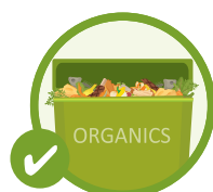
Organic Waste from Commercial Sources