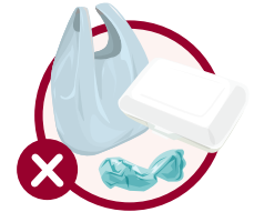
Styrofoam, Plastic Bags & Packaging