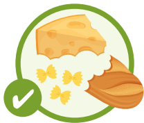
Dairy & Grains