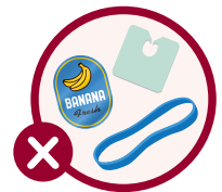
Produce Stickers, Elastics, Clips & Ties