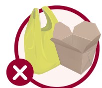
Compostable Plastic Bags or Containers